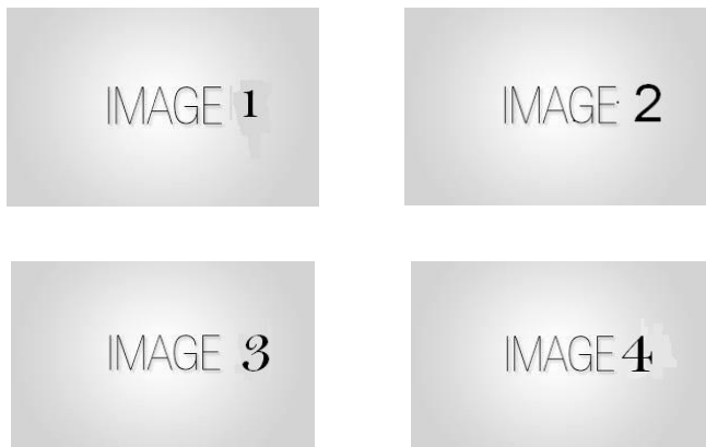
Figure 3: The layout of multipart images should be as per the above example within the table. All images must have the “Image” style applied.